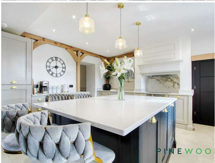
Sycamore Farm House, Town End, Shirland, Alferton, Derbyshire DE55 6BL